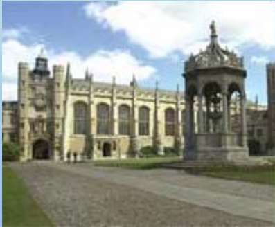
Cambridge [I was a student there]